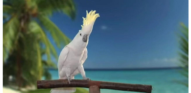
Snowball in his Taco Bell ad

Since then, Snowball has been on TV shows and commercials, including an ad for bottled water and for Taco Bell.