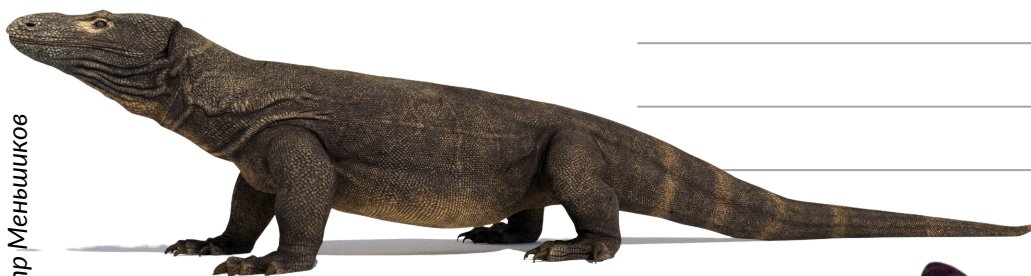
Megalania ( below ) went extinct from Australia more than 50,000 years ago.